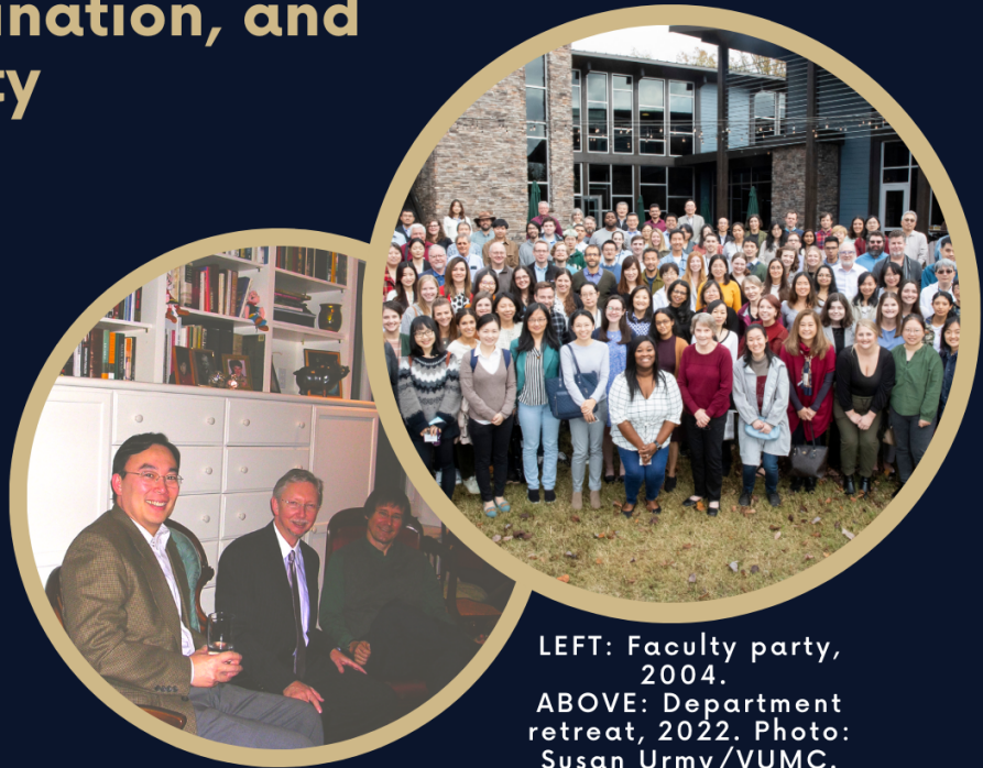
LEFT: Faculty party, 2004. ABOVE: Department retreat, 2022.

In-person at Langford Auditorium and livestreamed